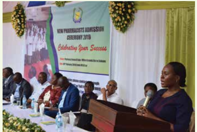
BRELA representative addresses issues concerning Business and Registration Licensing Agency (BRELA) to the newly Registered Pharmacists during the 6 th Admission and Registration Ceremony early this year.