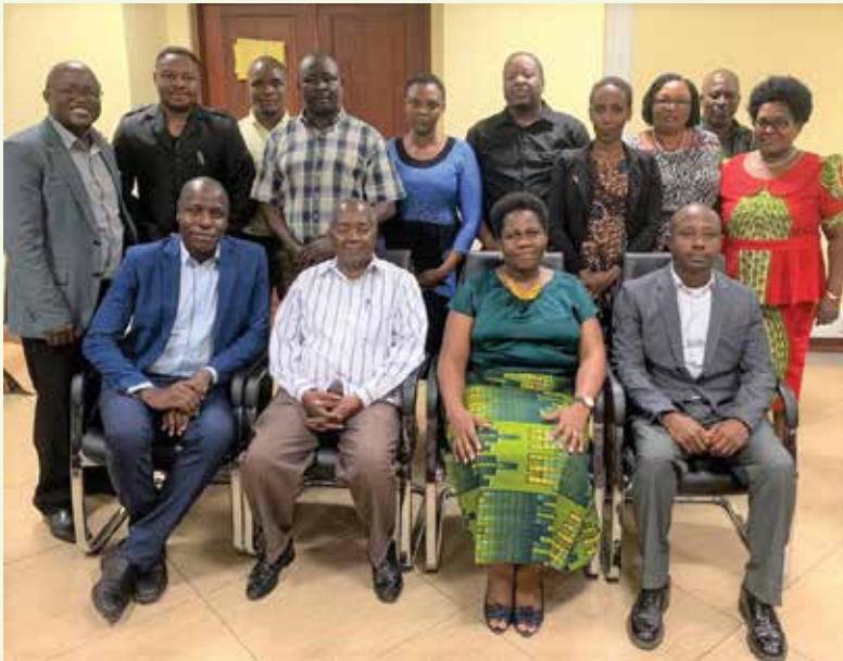
Council Board Members in a group photo with Secretariat during the 44 th Board Meeting held in Dar es Salaam in 19 March, 2019.