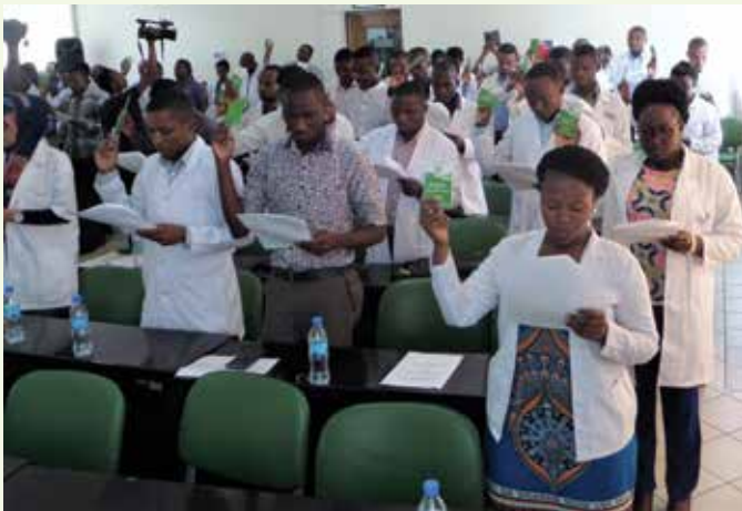
Newly registered pharmacists taking oath to serve the public with high quality, ethical and professional pharmaceutical services in January, 2019.