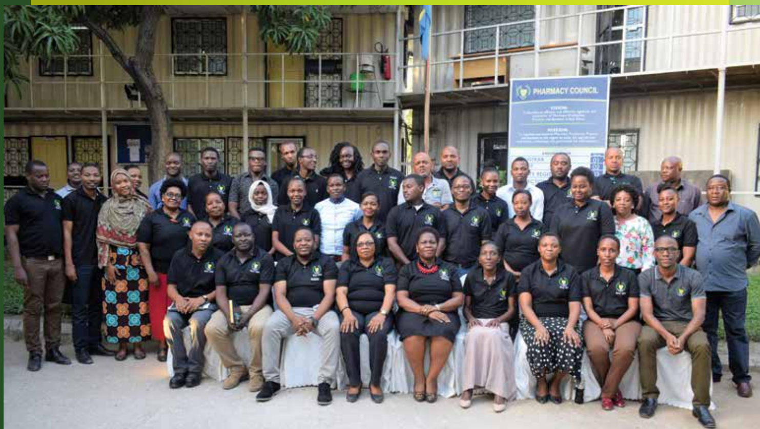
Pharmacy Council Secretariat group photo